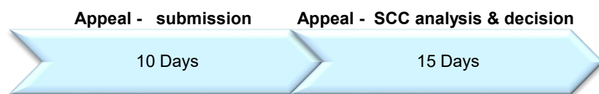
Table 1: Duplication Resolution Mechanism (DRM) Process Steps and Timelines

Appeals – Completion of the Appeal Request Report (ARR) (following SCC analysis & decision)